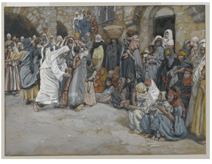
James Tissot, Brooklyn Museum