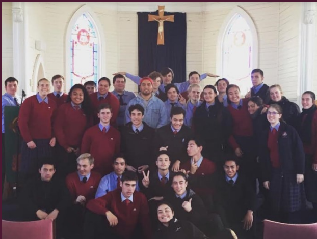
Our Year 13 students at the AttitudesNZ presentation on Thursday June 14th

We need to have a bit of a working bee ( many hands make light work ) so that we can tidy up all the weeds, lay some compost and plant some green mulch. We would also like to prep the ground for new garden beds and trees