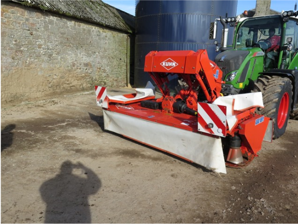
Lot 5018 Kuhn FC313 Rear Mower (2013)