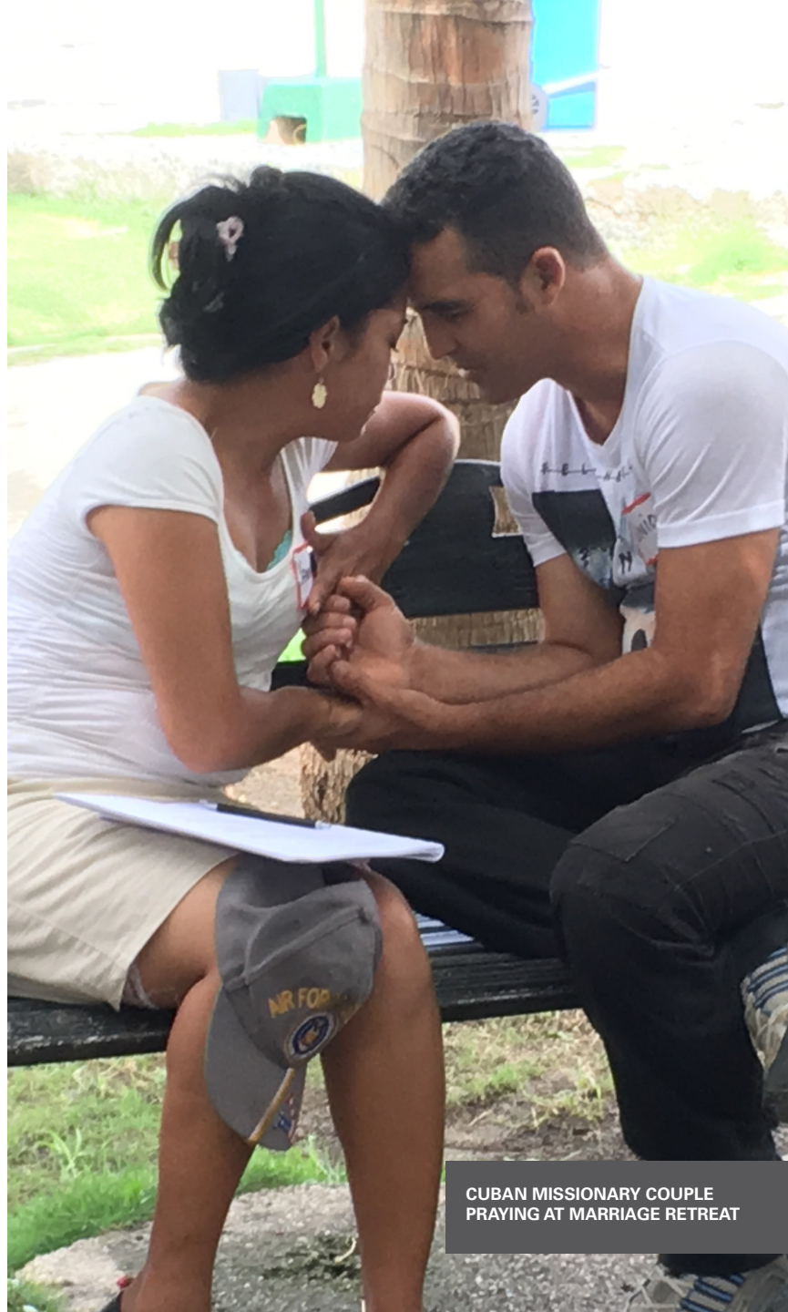
CUBAN MISSIONARY COUPLE PRAYING AT MARRIAGE RETREAT