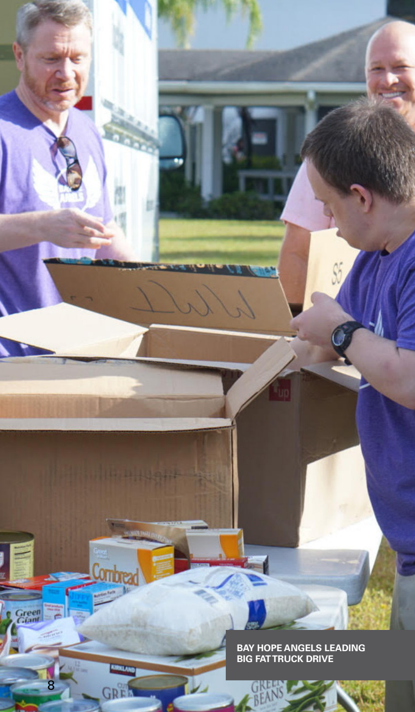
BAY HOPE ANGELS LEADING BIG FAT TRUCK DRIVE