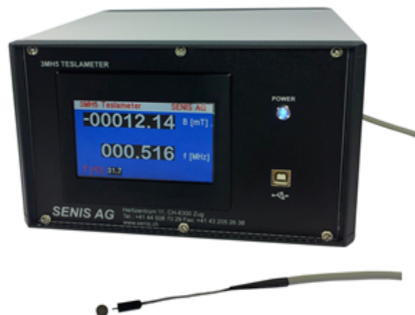
Figure 1. Low-Noise Teslameter 3MH5A with integrated Hall Probe