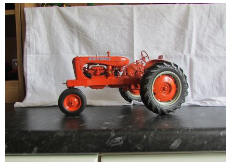
Lot 104 Allis Chalmers WC