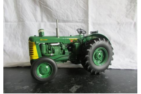
Lot 118 Oliver Super 99, Oliver Super 99GM (57) and Oliver SuperGM (54)