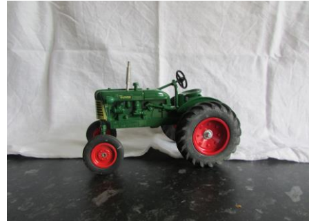
Lot 117 Oliver 440 Super and Oliver 44