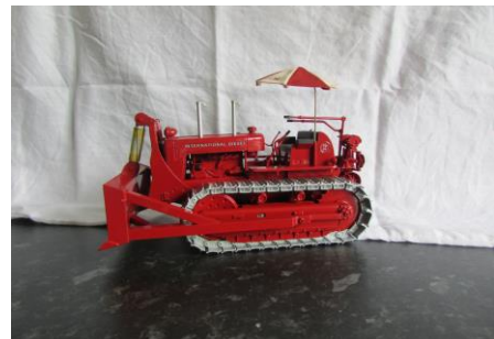
Lot 135 International TD14 and TD24 Crawlers