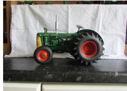
Lot 102 Oliver Super 99GM