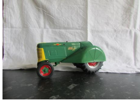
Lot 113 Oliver Super 77 and Oliver Orchard 77