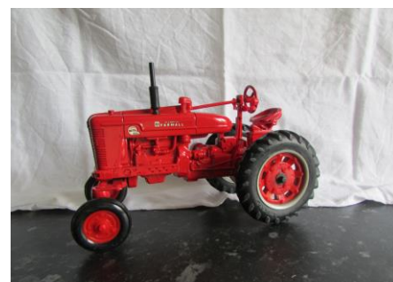
Lot 128 Farmall 450, Farmall 450 Tri and Farmall M-TA