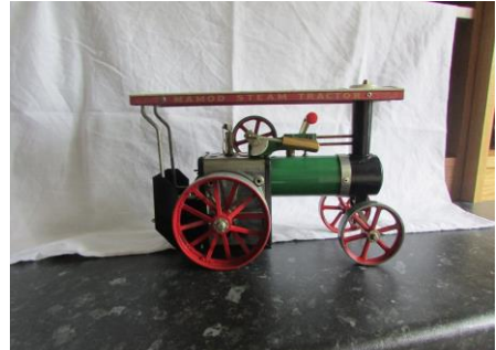
Lot 137 Mamod Road Roller and Mamod Steam Tractor