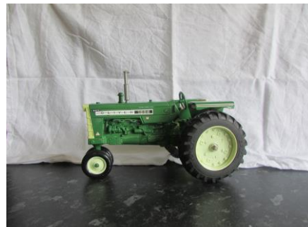
Lot 110 Oliver 1555 and Oliver 1555 Tri