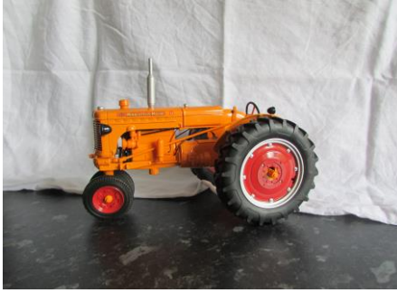
Lot 132 Minneapolis-Moline