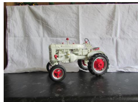
Lot 106 Farmall Super A Demo