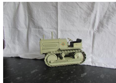
Lot 134 Allis Chalmers K and Monarch Dozzer and Crawlers