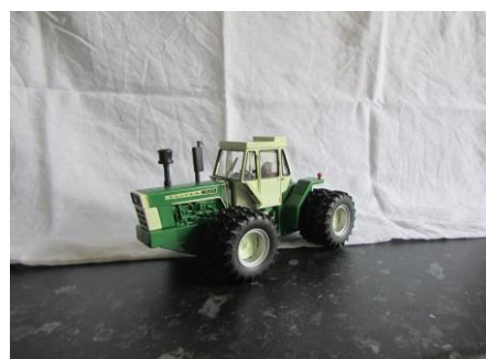
Lot 130 Oliver 2655 and Oliver 2655 Double Wheel