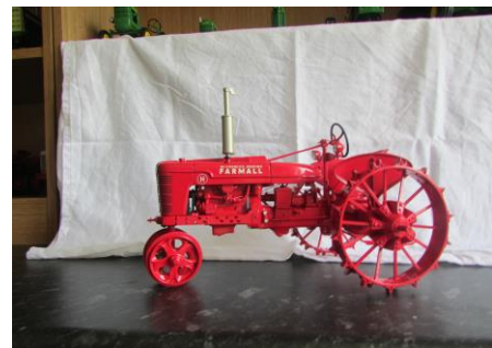
Lot108 Farmall H