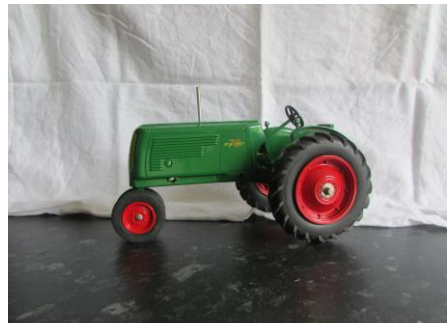
Lot 115 Oliver Rowcrop 70 1935 and Oliver Rowcrop 70 1945