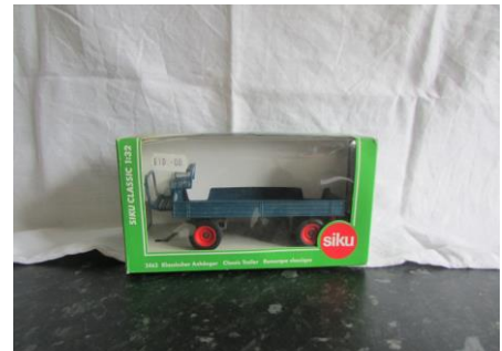
Lot 139 Lanz Bulldog, Hamomag R45 and Trailer