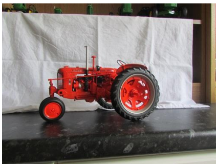
Lot 103 Case SC