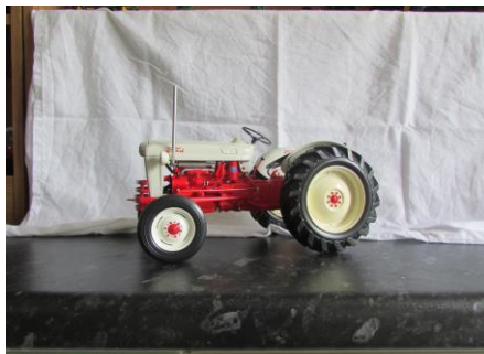
105 Ford 1953 Jubilee