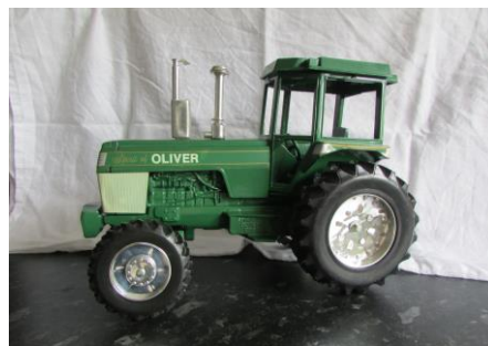
Lot 121 Oliver 600 and Oliver Spirit of America