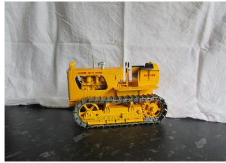
Lot 136 Oliver OC-3 and Oliver OC-12