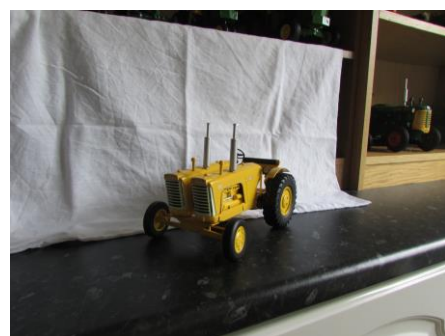
Lot 131 Oliver 880 Industrial