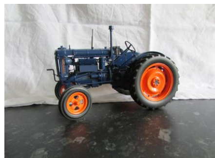
Lot 125 Fordson Major and Ford E27N Major