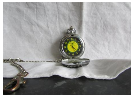
Lot 129 J.Deere 3010, 5010,G.P, L, LA and Watch