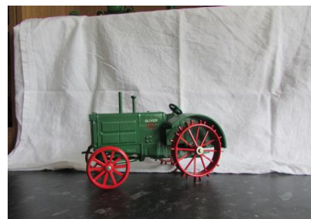
Lot 120 Oliver Super 77 and Oliver 90