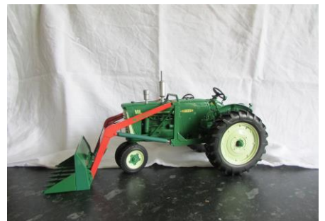
Lot 116 Oliver 660 & Reaper, Oliver 770 & Loader and Oliver 880 & Loader