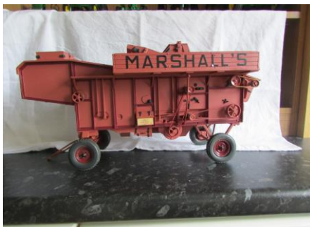
Lot 138 Marshall Thresher Mill