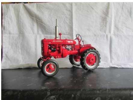
Lot 107 Farmall A