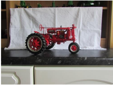
Lot 101 Farmall F-20