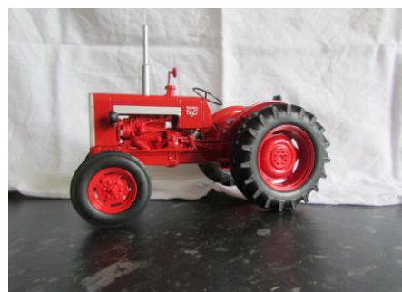
Lot 124 Valmet 20 and Valmet 565