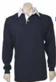
Rugby Jersey Unisex $65.00