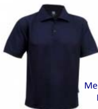
Polo Shirt Men's and Ladies styles Navy, grey, white $40.00