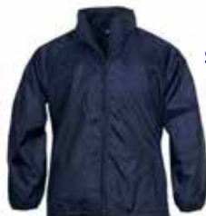
Spinnaker Jacket Unisex, lightweight $60.00