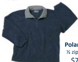
Polar Fleece ½ zip, Unisex $70.00