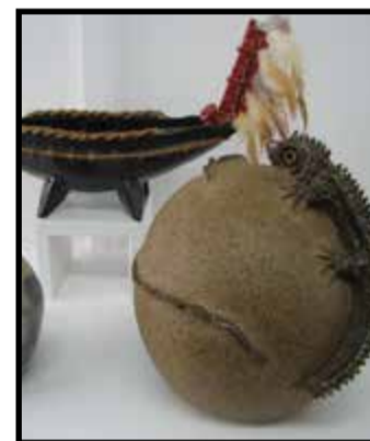
Cover image courtesy: Items made by Tony Kale and for sale at Outrageous Gallery. See Gallery listings for contact information.