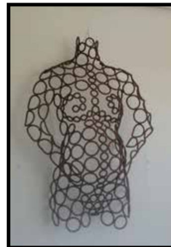
Cover image courtesy: Peter Shepherd showing at NEW art gallery/studio workshop EXPRESSIONS

presents the "Working in new ways" series at Confluence