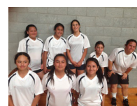
Mixed 1 st Place