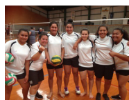
Senior Girls / 7 th Place.

We currently have 4 teams in the Secondary School Volleyball Competition. The turn-out of students creates for an awesome environment. We have some pretty good results so far and with only 3 games left we are hoping to place in the top three for most of our teams.