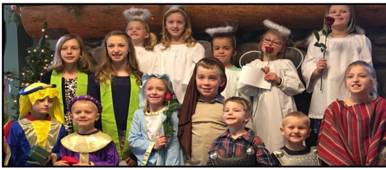
A Superhero Christmas December 18th in Worship