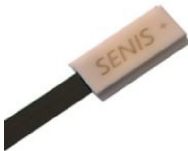
Figure 1. SENIS fully integrated 3-Axis Hall probe 03C