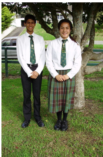
Whanganui High School - PROSPECTUS 2016

Cycle helmets are compulsory, as required by law.