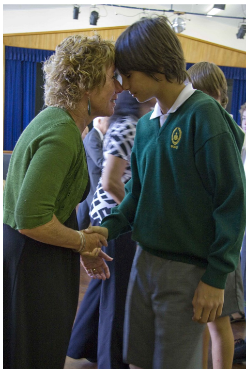
Whanganui High School - PROSPECTUS 2016

The Academic Scholarship exams usually take place in November each year. These exams are in addition to the entrance exams which are sat by all students coming to Whanganui High School at Year 9.