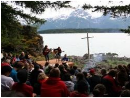
Learn more at www.glaciercamp.org Questions: 844-2114

VBS DAY CAMP Registration is now open! Since 1931, kids have been having the time of their lives at Glacier Camp. Kids will meet a caring, young Christian staff who model following Christ and exhibit a deep love for kids exploring both nature and the nature of a growing relationship with God. The mission of FPC is to provide free or greatly reduced VBS to kids throughout our valley. Day Camp is July 4-8 for children ages 6-10. A shuttle from the FPC Kalispell parking lot will transport kids there and back each day. Cost is $150 per child with a deposit of $75. HOWEVER, FPC will cover the necessary $75 deposit for as many kids as we can until scholarships run out. Pick up the VBS Registration form from the church AND turn it in to the church. The camp scholarship funding is expected to cover the remaining costs. Our tailored registration form can be downloaded on the homepage: www.fpckalispell.org .