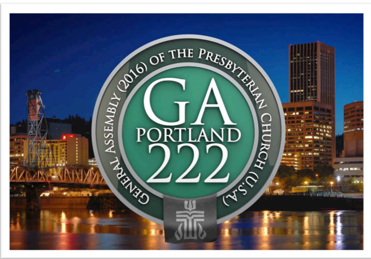
View the 222 nd General Assembly video at fpckalispell.org