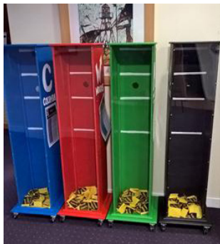
House Ka Pai Card Tally Bins