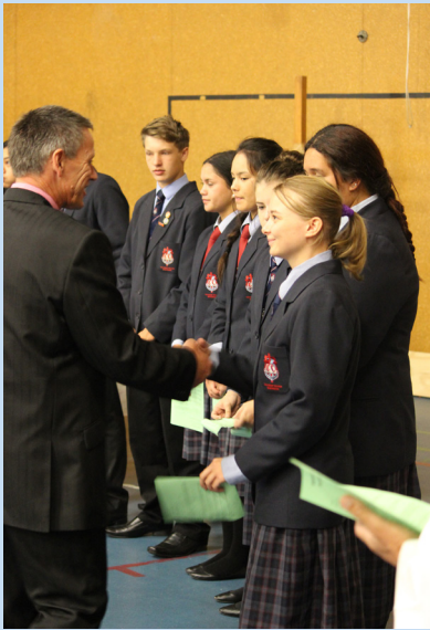
Prefect Team receives their badges at the Missioning Mass

It was great to welcome so many new families (and some old faces) to Cullinane College in 2015. Unfortunately, I was sitting in a hospital bed when the Powhiri was held for the Year 9 students but I was able to catch up with many of the students and their families during the Year 9 Journey Programme the following week. The feedback from staff and the Year 13 student Leadership Team was very positive and we are really looking forward to seeing the Year 9 group make their unique contribution to our College.