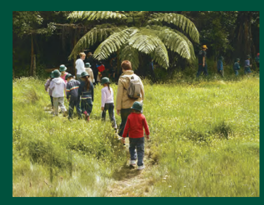
Exploring the wonders of the wetland.