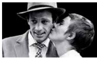
Jean Luc Goddard's Breathless , Whanganui Film Society, Mon 20 Oct