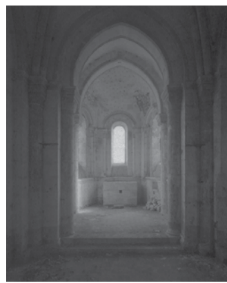
Platinum prints by Lawrence Aberhart, on show this month at McNamara Gallery Photography

From The Hero's Journey: Part 2 by Graham Hall The exhibition comprises of a narrative of 12 woodcuts developing the ideas within Joseph Campbell's book The Hero of a thousand Faces exploring the rites of passage we all navigate. Everyone is a Hero in their own Story. Space Studio & Gallery 11–17 Oct