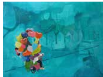
Painting by Cheleigh Dunkerton featured in the group exhibition When In China , on show at Space Studio & Gallery 18–31 Oct