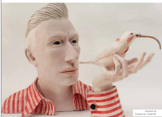
Artwork by Andrea du Chatenier

Whanganui UCOL are very excited to offer 4 Spring Art courses in September 2014, the first of a series.