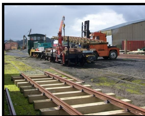
Dennis Loading the track sets