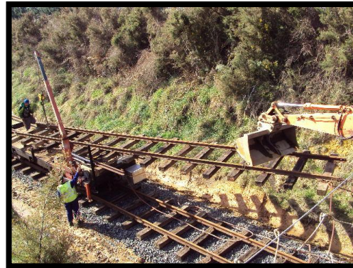
Track sets being lifted into place