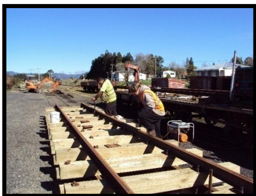
Shadze & Russell making track sets