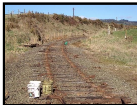
Sleepers still to be lifted