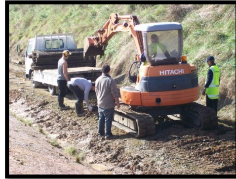
Dennis' truck removing sleepers