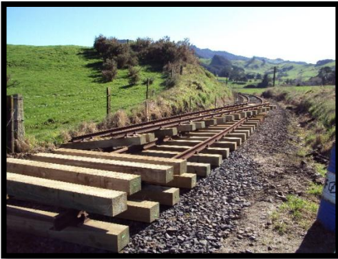
Track sets at the site