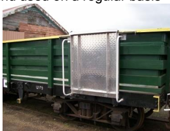
It is now our bike carriage