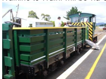
First arrived it was a passenger Carriage

The UG wagon from Waitara is now been turned into a bike carriage, in the hope that the bike trail from Waikino to Waihi will be via Goldfields Railway, and used on a regular basis