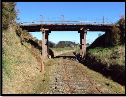
Old Tauranga Road bridge