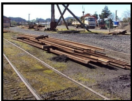
The removal of the old rails