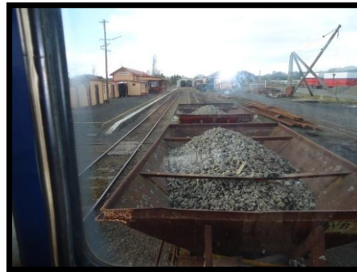
Ballast at station