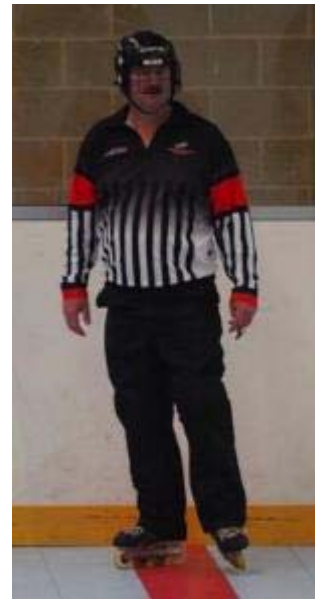
Rule Change Notification regarding Safety Equipment : Players