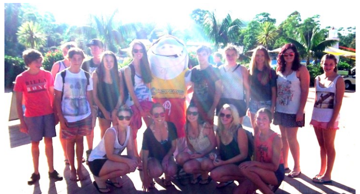
Woonona Rookies (Squids)