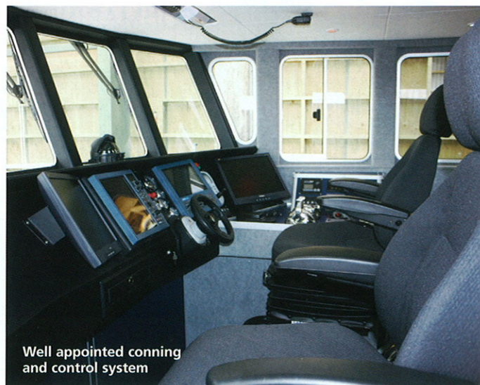
Well appointed conning and control system

When the National Institute of Water and Atmospheric Research NIWA began drawing up a wish list for their new inshore research vessel, they were painting with a fairly broad brush.