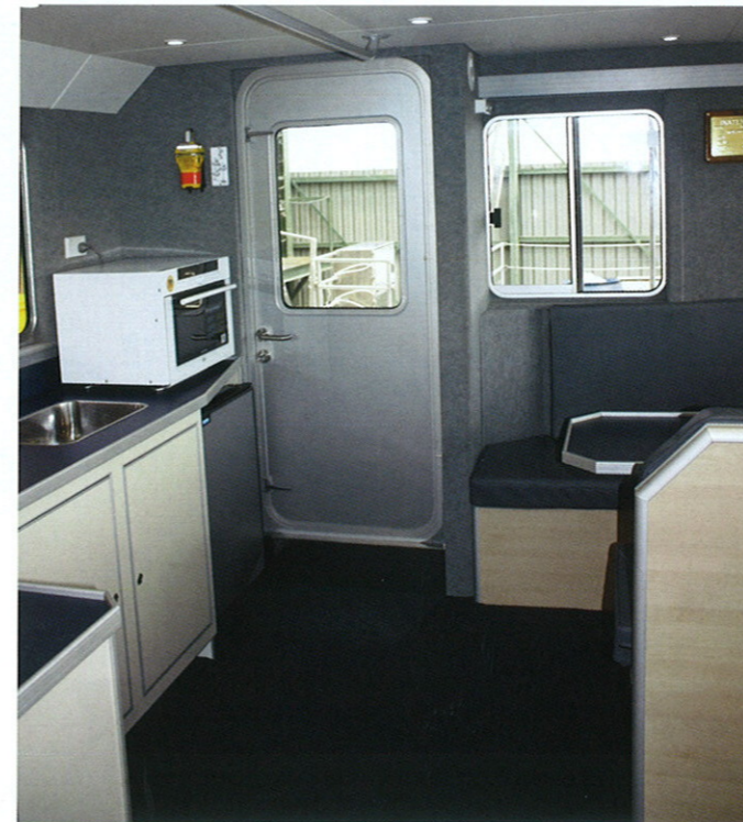
ABOVE: Galley and crew area BELOW: The rear area of the deck house and access to the flybridge

Teknicraft, the Auckland design firm run by Nic de Waal, who drew the Auckland police launch Deodar III , Whalewatch vessel Wawahia and scores of other power catamarans which are operating successfully all over the world, were contacted to design a 13.9 metre catamaran with their signature asymmetrical