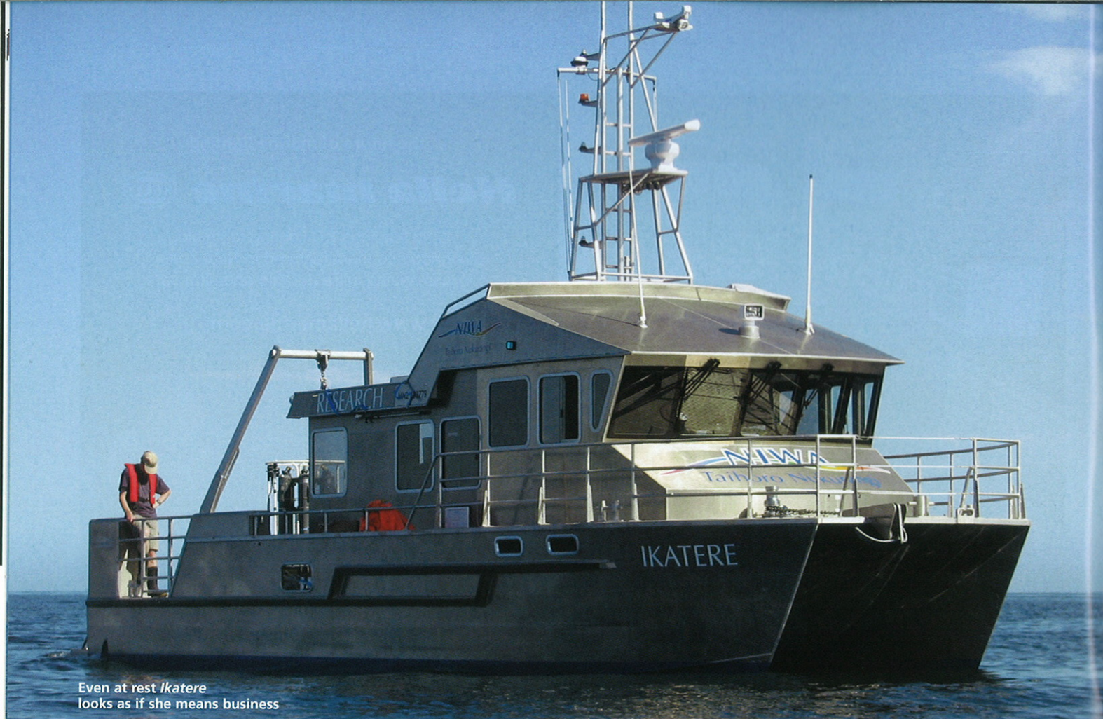
Even at rest Ikaterere looks as if she means business