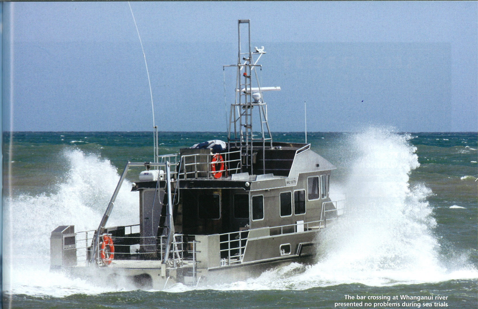
The bar crossing at Whanganui river presented no problems during sea trials

Down below, the engines produce 372kW (500 horsepower) at 2600rpm and due to the asymmetrical shape of the hulls which prevent using a straight shaft to drive the jet units, two offset 1.5m long intermediate shafts use a universal joint and Vulkan flexible coupling.