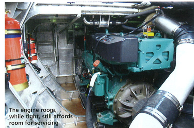
The engine room, while tight, still affords room for servicing

One drawback of Wawahia's asymmetrical hull form is that it's not possible to line the engine coupling and jet unit up in a straight line. Q-West solved that problem by installing intermediate shafts about 1.5m long with a universal joint and Vulkan flexible