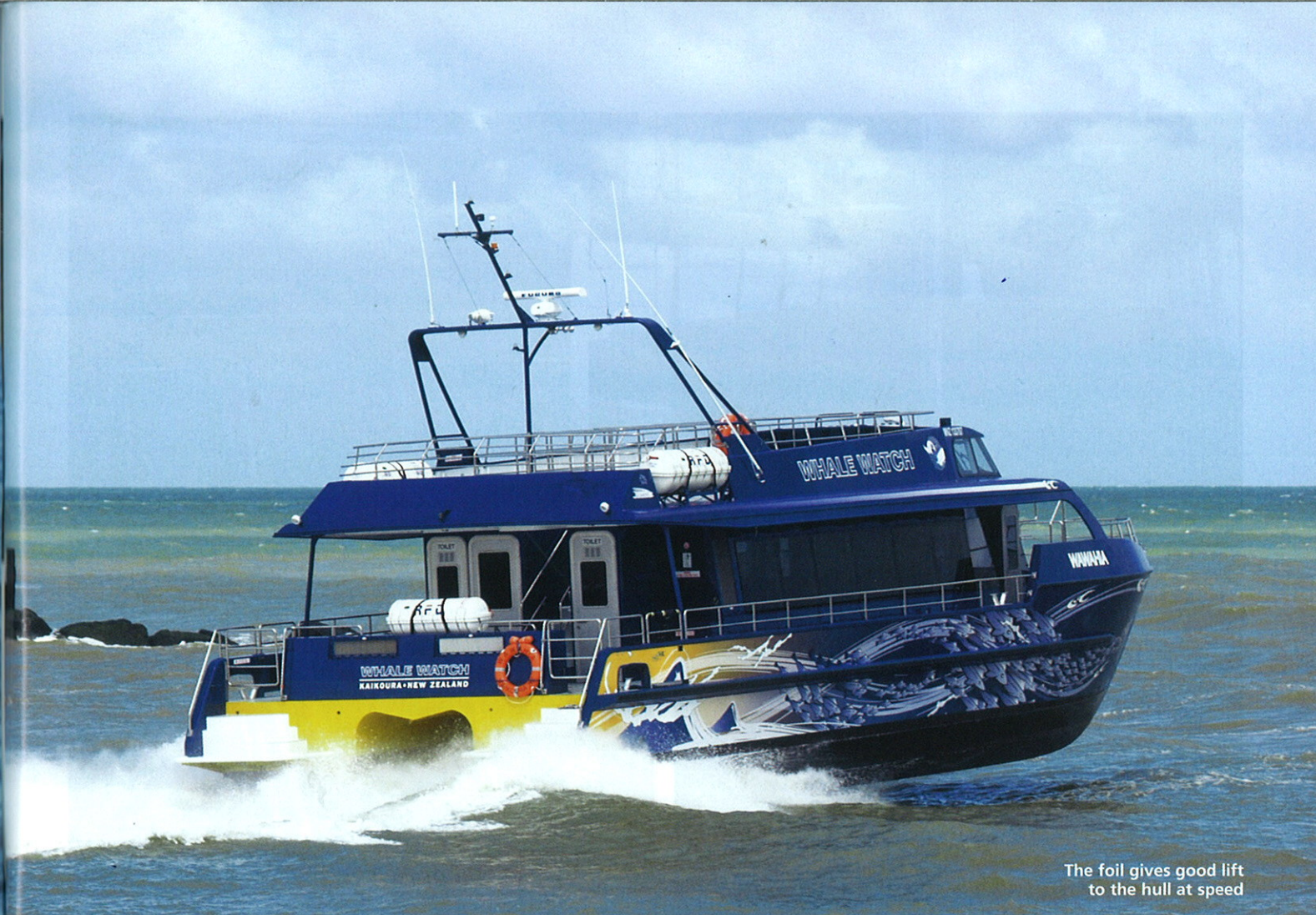
The foil gives good lift to the hull at speed

All round visibility is good from the helm seats except aft – the aft bulkhead is the forward termination of the observation deck.