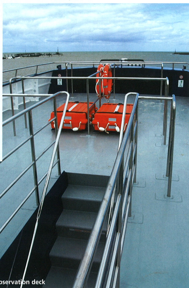
Upper observation deck

What Hamilton calls a "split duct astern deflector" holds the key to Wawahia's nimble handling. It's a tricky development of the buckets that drop over the jet stream to make the boat go backwards – the split ducts funnel water down away from the transom and away from the intakes so the units develop about 60 percent of their total forward thrust when going astern.