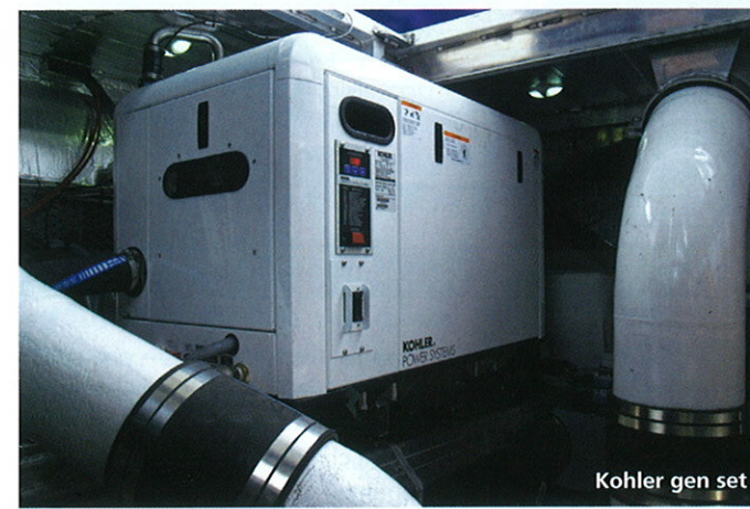
Kohler gen set