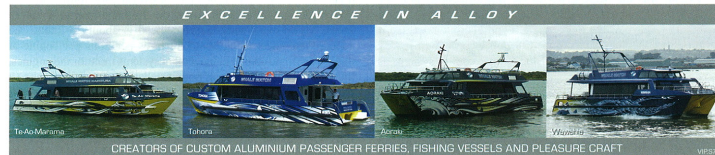
CREATORS OF CUSTOM ALUMINIUM PASSENGER FERRIES, FISHING VESSELS AND PLEASURE CRAFT

VESSEL SUPPLIER TO WHALE WATCH KAIKOURA, NZ – WINNERS OF THE VIRGIN HOLIDAYS RESPONSIBLE TOURISM AWARD